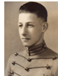
Plebe

It was very late at night on 8 April that I was told by my battalion commander that Bataan was being surrendered effective at 0600 the next day. . We were to destroy all our weapons and equipment except our vehicles because we would need them in which to ride out of Bataan to wherever the Japanese would be taking us. I destroyed all our